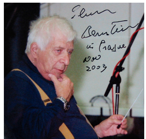
ELMER BERNSTEIN 1922 - 2004